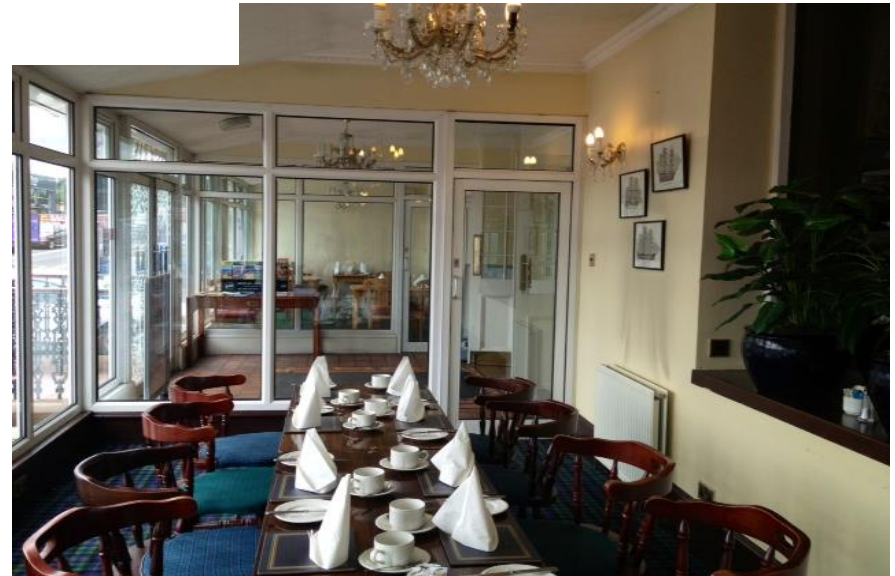
Small Conservatory Capacity: 10 Seated

Both the Small and Large Conservatory areas can be used simultaneously, these rooms are located just off the bar and Castles restaurant. Capacity: 34 Seated for both small and large conservatory.