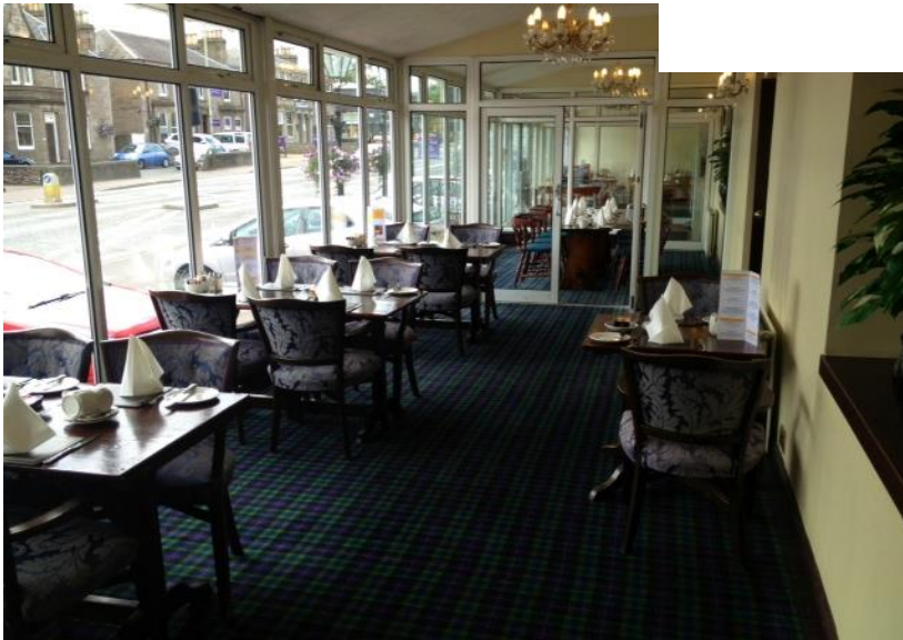
Large Conservatory Capacity: 24 Seated